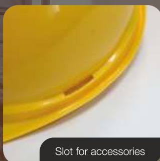
Slot for accessories